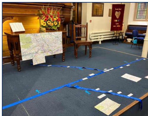
A floor representation of the Tyne Rivers with location of the churches/chapels. Plus a large scale map of the Circuit area marking the churches/chapels.