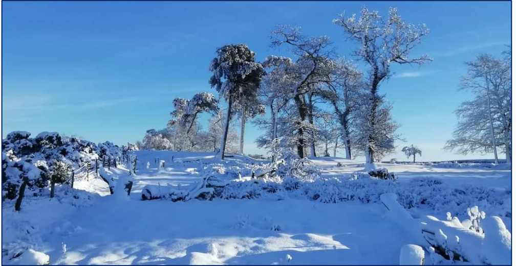
A Prudhoe Snow Scene

Encouraging Enabling Challenging in the Tynedale Methodist Circuit