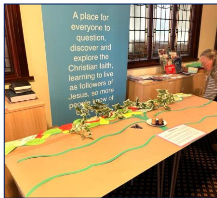
A representative vine on which people labelled bunches of grapes to thank God for the fruit and gifts He has already given us.