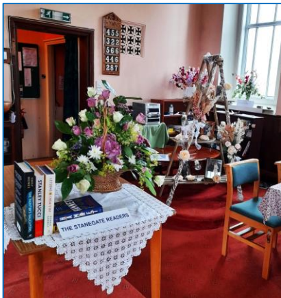
The Stanegate Readers display and the 'white corner' with chapel members wedding photographs

Most days refreshments were served and we collected money for Tools for Self-Reliance £180, when old unwanted tools were collected. Friday and Saturday were very busy.