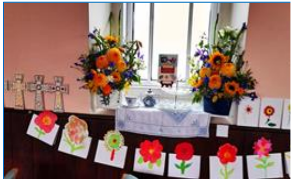
The Messy Vintage Window Display with some examples of craft activities

We also collected for Medecin Sans Frontier and the chapel.